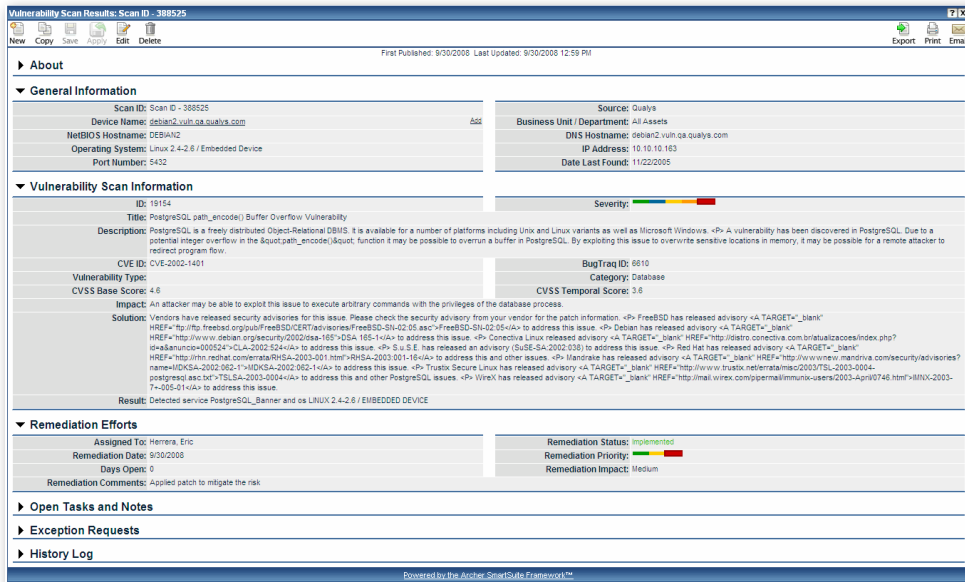
Figure 3: QualysGuard host vulnerability information in Archer